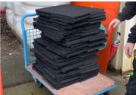
old rubber gym mats