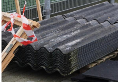
used corrugated roof sheets