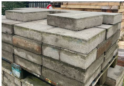
leftover concrete tiles