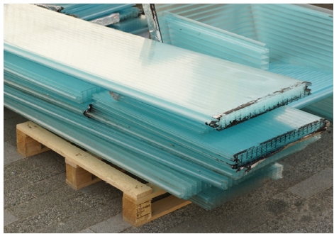
used polycarbonate panels