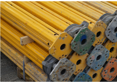
rented concrete formwork