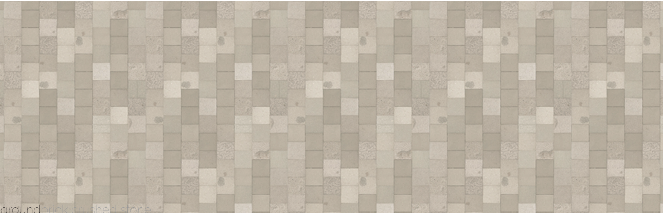
groundbrick crushed stone